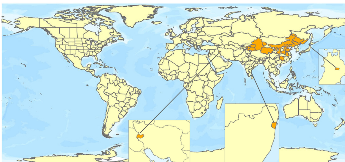
FIGURE 1 Global distribution of Eulecanium giganteum (data source: Deng et al., 2016; García Morales et al., 2016; Kondo & Watson, 2022; Suganthi et al., 2022). The polygons with highlighted orange colour indicate the administrative areas where E. giganteum is present.

E. giganteum is an Asiatic species first described in Morioka, Japan (García Morales et al., 2016). Its present known distribution includes most of northern China, India, Iran, Japan and eastern Russia (Primorsky Krai) (García Morales et al., 2016; Deng et al., 2016; Kondo & Watson, 2022; Suganthi et al., 2022; see Figure 1).