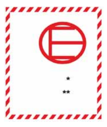
Excepted Quantities Mark