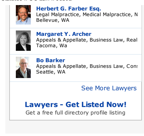
Copyright © Justia :: Company :: Terms of Service :: Privacy Policy :: Contact Us